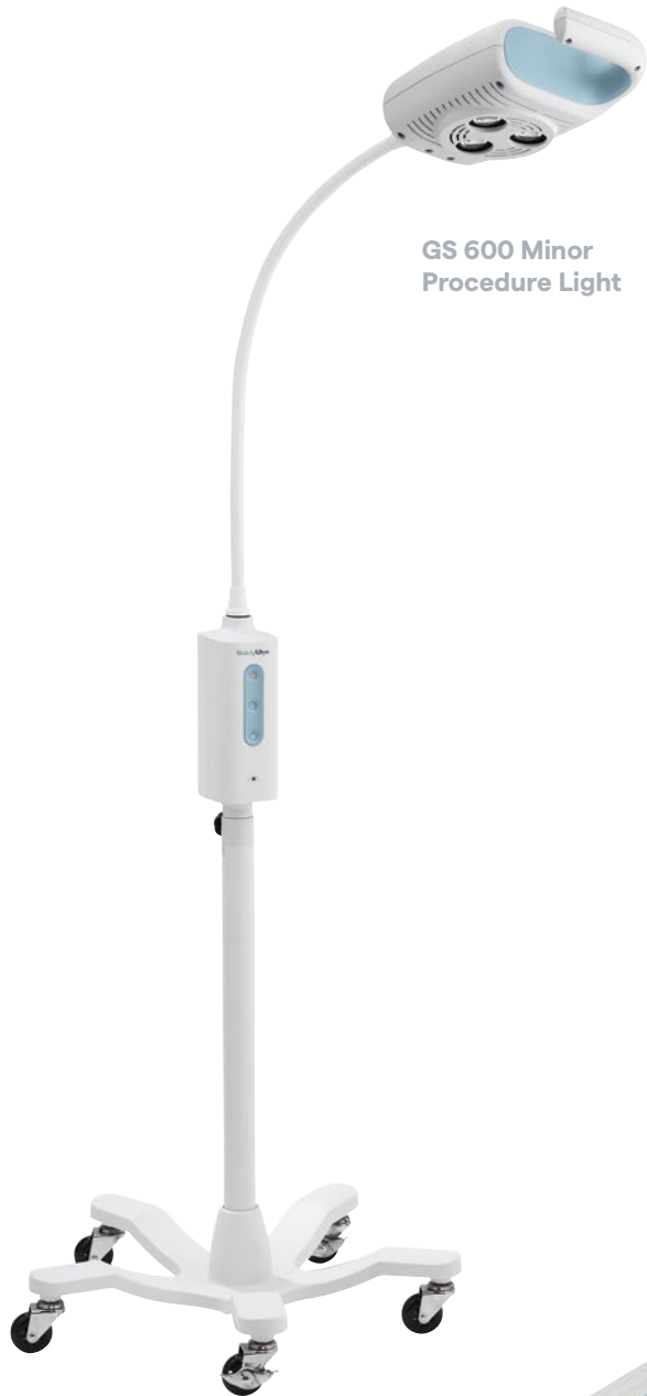
GS 600 Minor Procedure Light