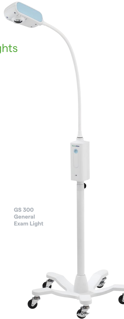
GS 300 General Exam Light