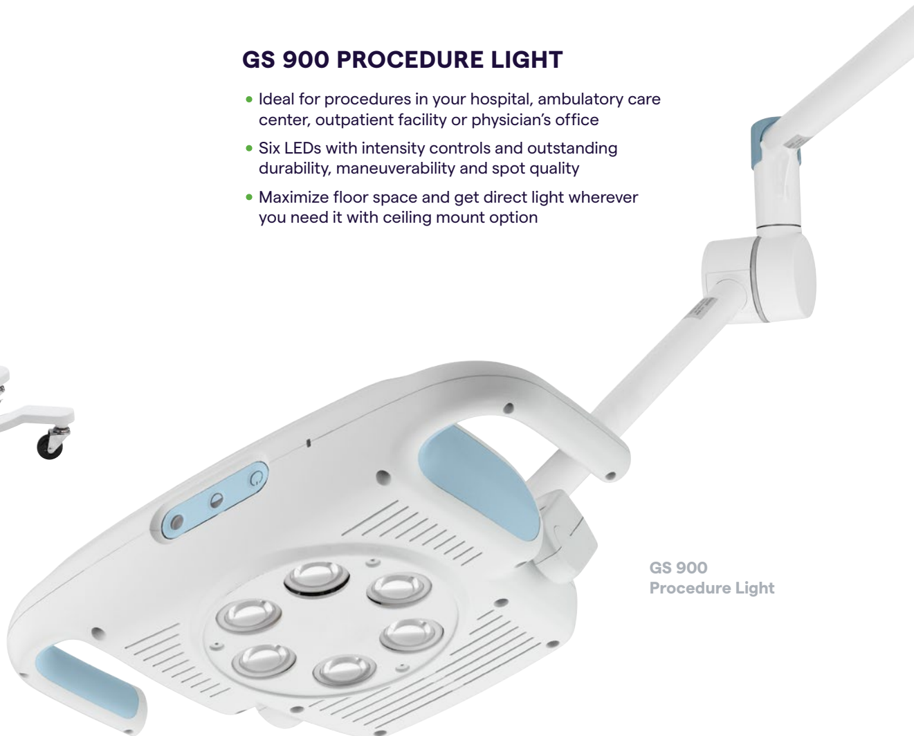
GS 900 Procedure Light