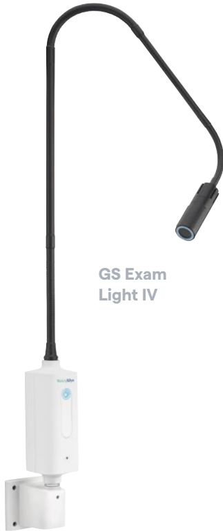
GS Exam Light IV