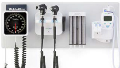
Welch Allyn Green Series 777 Integrated Wall System

Explore our new systems with Plus models or update your device heads which are backwards compatible.