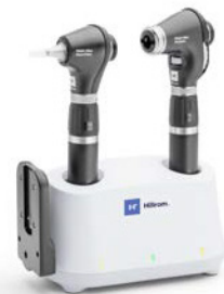
Welch Allyn Universal Charger and Desk Sets

Please contact a Baxter representative or authorized distributor for further information.