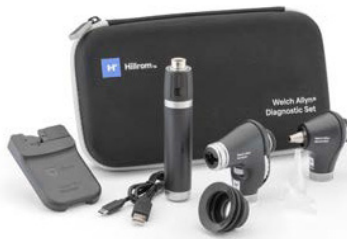
Welch Allyn Diagnostic Sets