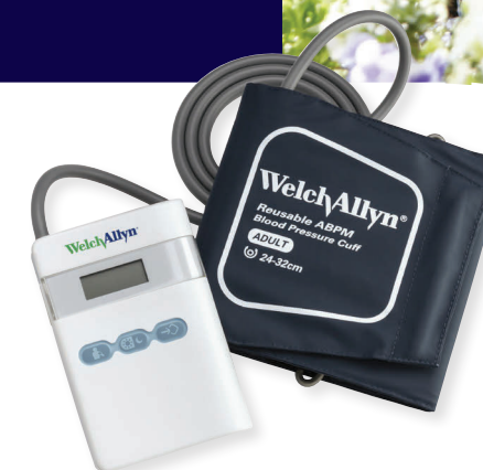
Welch Allyn® ABPM 7100 Ambulatory Blood Pressure Monitor