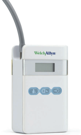
Welch Allyn® ABPM 7100 Ambulatory Blood Pressure Monitor