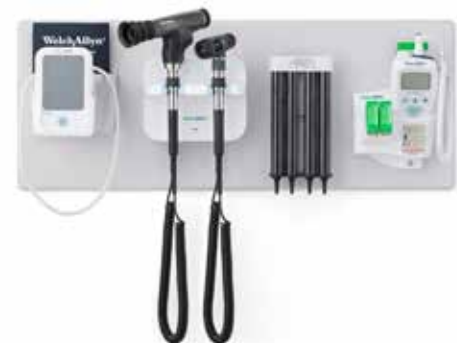
Wall Mount Option with Bracket (Integrated Wall System sold separately)