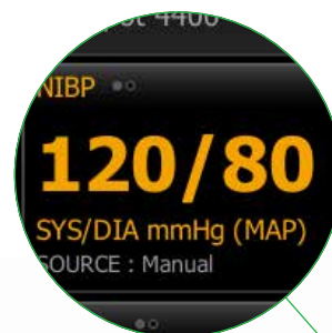
Easy to Navigate, Easy to Use

Save time and help reduce data entry errors by sending patient data to the EMR.