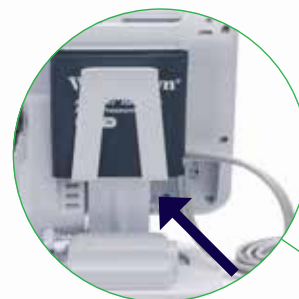
EMR Connectivity via USB Cable