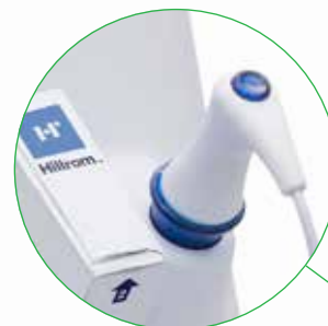
All-In-One Vitals Capture