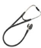
■ 5079-125 Harvey™ Elite® Stethoscope, Black