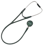
■ 5079-284 Harvey™ Elite® Stethoscope, Forest Green