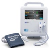
Welch Allyn® Spot Vital Signs® 4400 Device with SureBP Non-invasive Blood Pressure and SureTemp Plus Thermometer