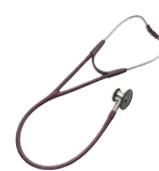
■ 5079-270 Harvey™ Elite® Stethoscope, Burgundy