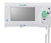
Welch Allyn Connex® Spot Monitor with SureBP Noninvasive Blood