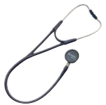
■ 5079-271 Harvey™ Elite® Stethoscope, Navy