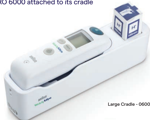
Large Cradle - 06000-300

Helps you minimize theft and loss, keeping the PRO 6000 attached to its cradle