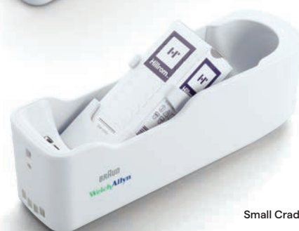
Small Cradle - 06000-200